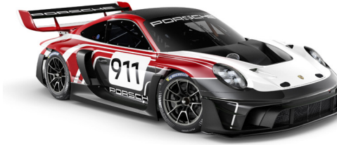
● Flacht Design