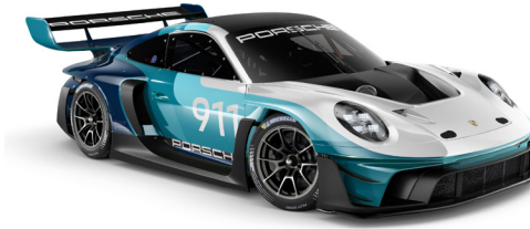
● Speed Icon Design