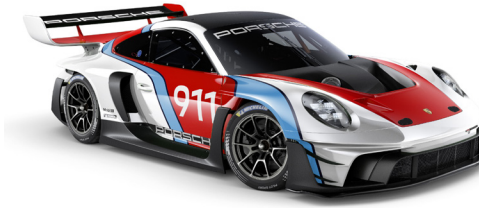
● Rennsport Reunion Design